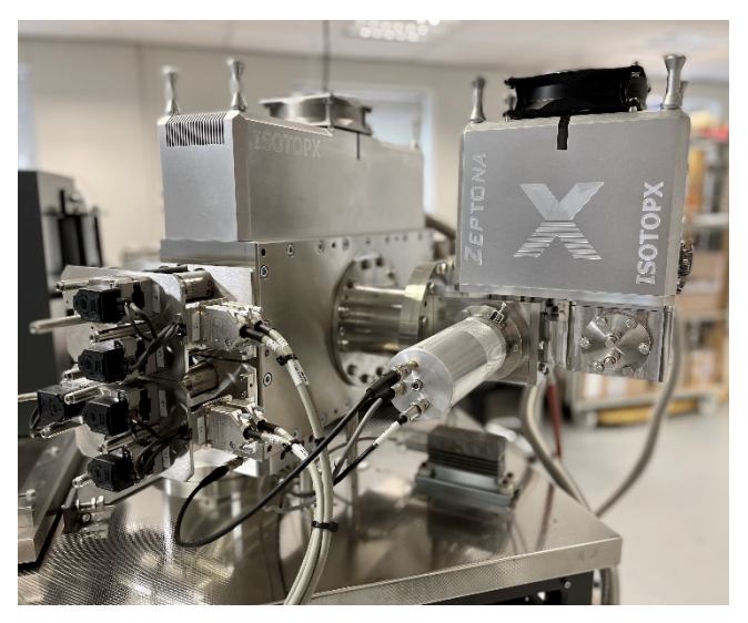
Figure 1. Phoenix TIMS collector equipped with (from left to right) an array of 9 ATONA® Faradays, WARP filter, ion counting Daly and Zeptona rear Faraday.

The Zeptona system comprises a custom designed single Faraday detector mounted behind the main multicollector of the Phoenix TIMS, fitted with an ATONA® amplifier. This combination provides an ultra low noise, low drift, high dynamic range Faraday collector that can be used in conjunction with the main ATONA® Faraday collectors and also the ion counting detectors in the main array or the ion counting Daly detector, as shown in Figure 1.